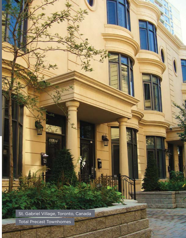
St. Gabriel Village, Toronto, Canada

Advanced technologies used in production create an improved quality product (i.e. reduced tolerances, thinner sections, engineered solutions) compared with other materials. Additionally, quality can be checked before a unit is inserted into the structure or site work!