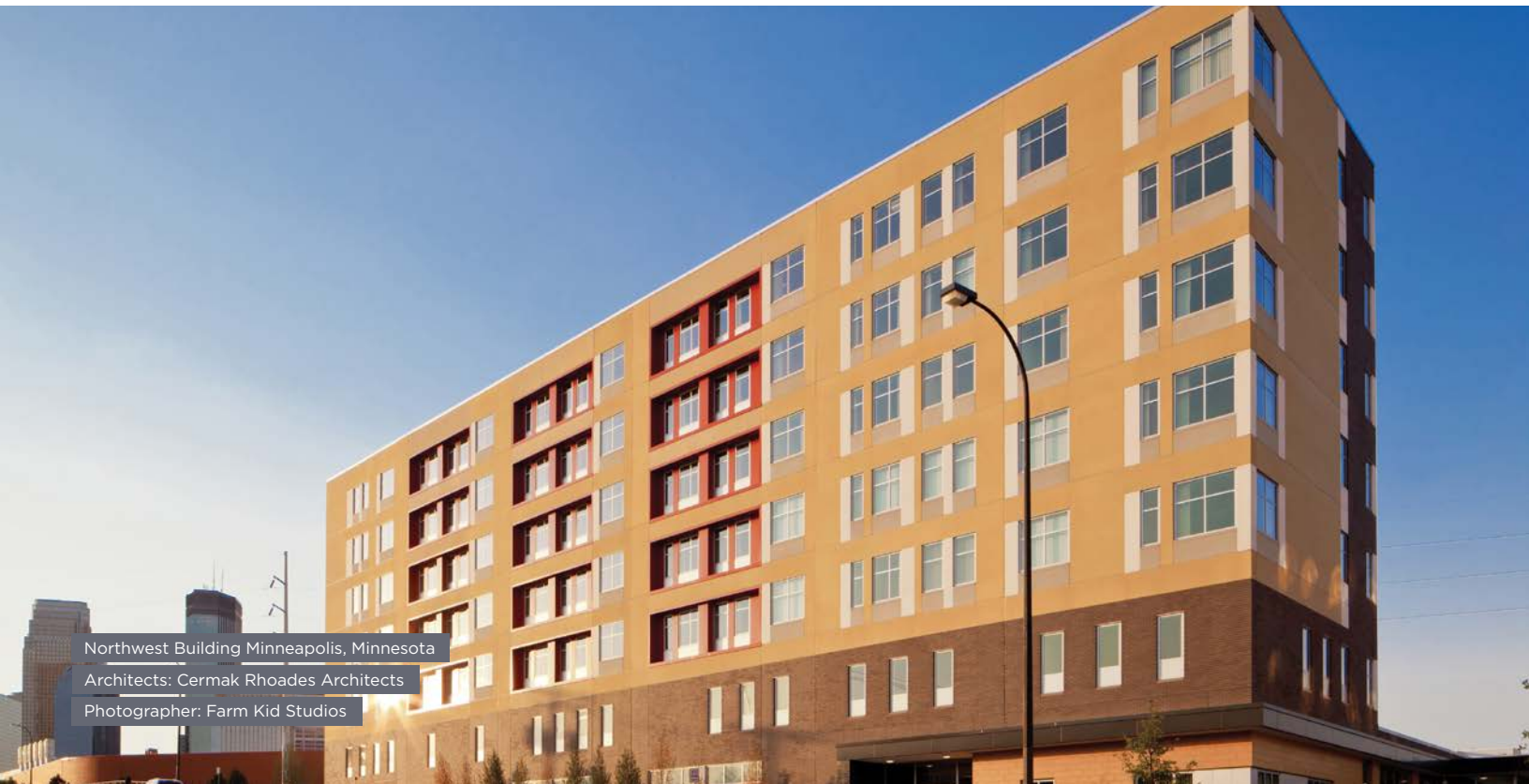
Northwest Building Minneapolis, Minnesota

The residents of more robust cities and towns experience major benefits from the overall improvement of building resilience: fewer burdens on local services, a more stable local economy that provides consistent sources of money to run the municipality, and a more enduring legacy for future generations. Builders, architects, and designers have come to recognize that more durable public buildings, private homes, and businesses, often built with concrete, resist damage from natural disasters and reduce the impact communities have on our planet.