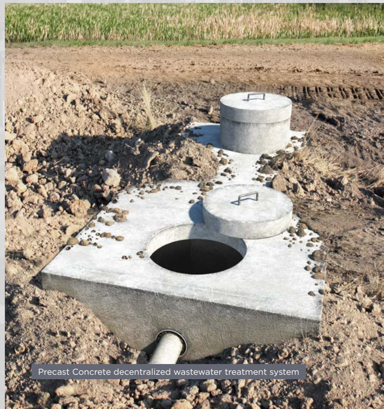
Precast Concrete decentralized wastewater treatment system

The global insurance industry tracks the number of natural catastrophes worldwide. The trend in catastrophes caused by weather, water, or climate has increased dramatically over the last 30 years. In 2015 Insurers paid out around $27 billion for natural disaster claims with weather causing 94 percent of incidents, underscoring the challenge posed by climate change. Insured losses due to natural disasters in the United States in 2015 totaled $16.1 billion, according to Munich Re, more than the $15.3 billion total for 2014. These costs are borne by individuals, businesses, and governments.