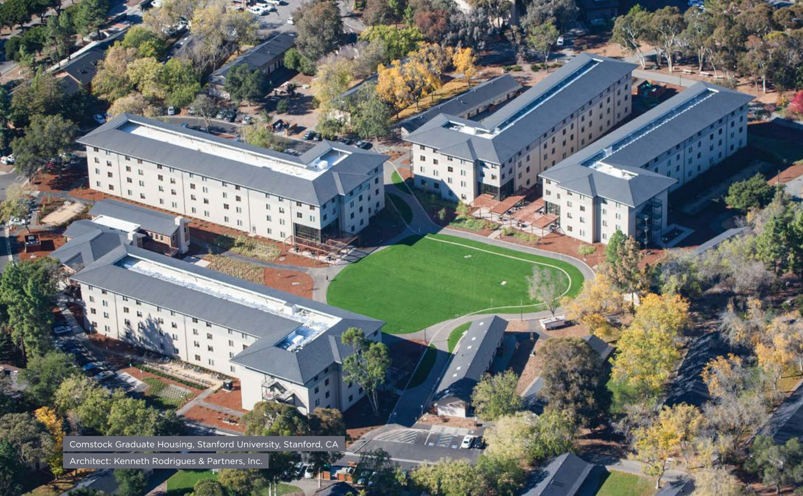
Comstock Graduate Housing, Stanford University, Stanford, CA