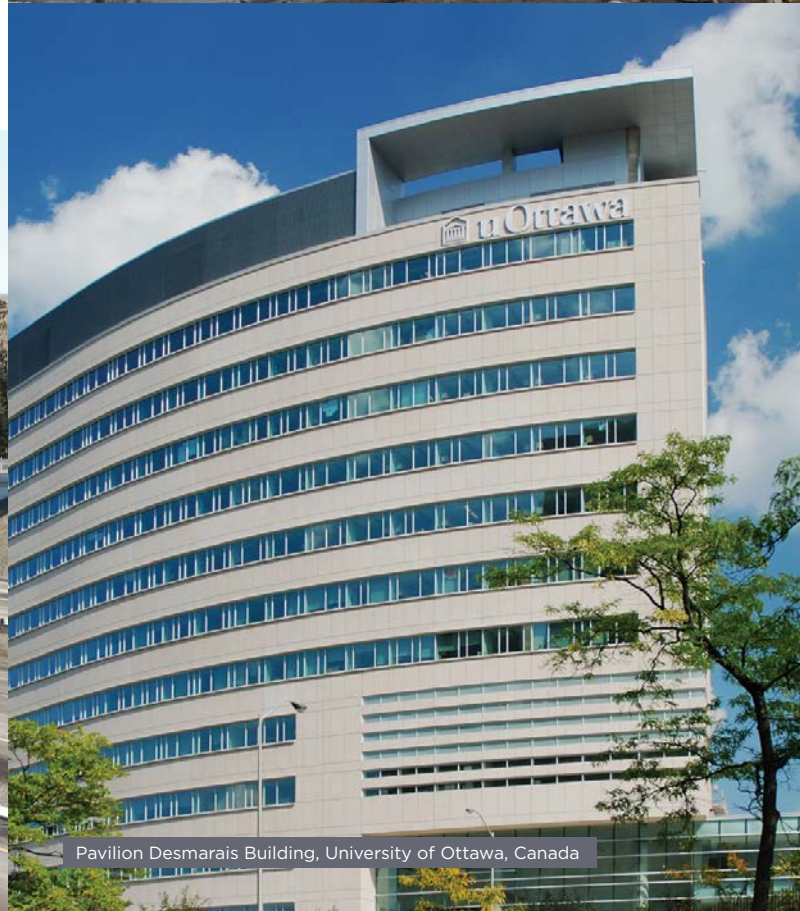
Pavilion Desmarais Building, University of Ottawa, Canada

Engineer: Hatch Mott MacDonald, Mississauga