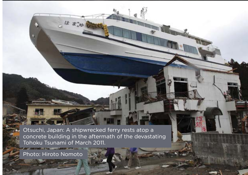
Otsuchi, Japan: A shipwrecked ferry rests atop a concrete building in the aftermath of the devastating Tohoku Tsunami of March 2011.