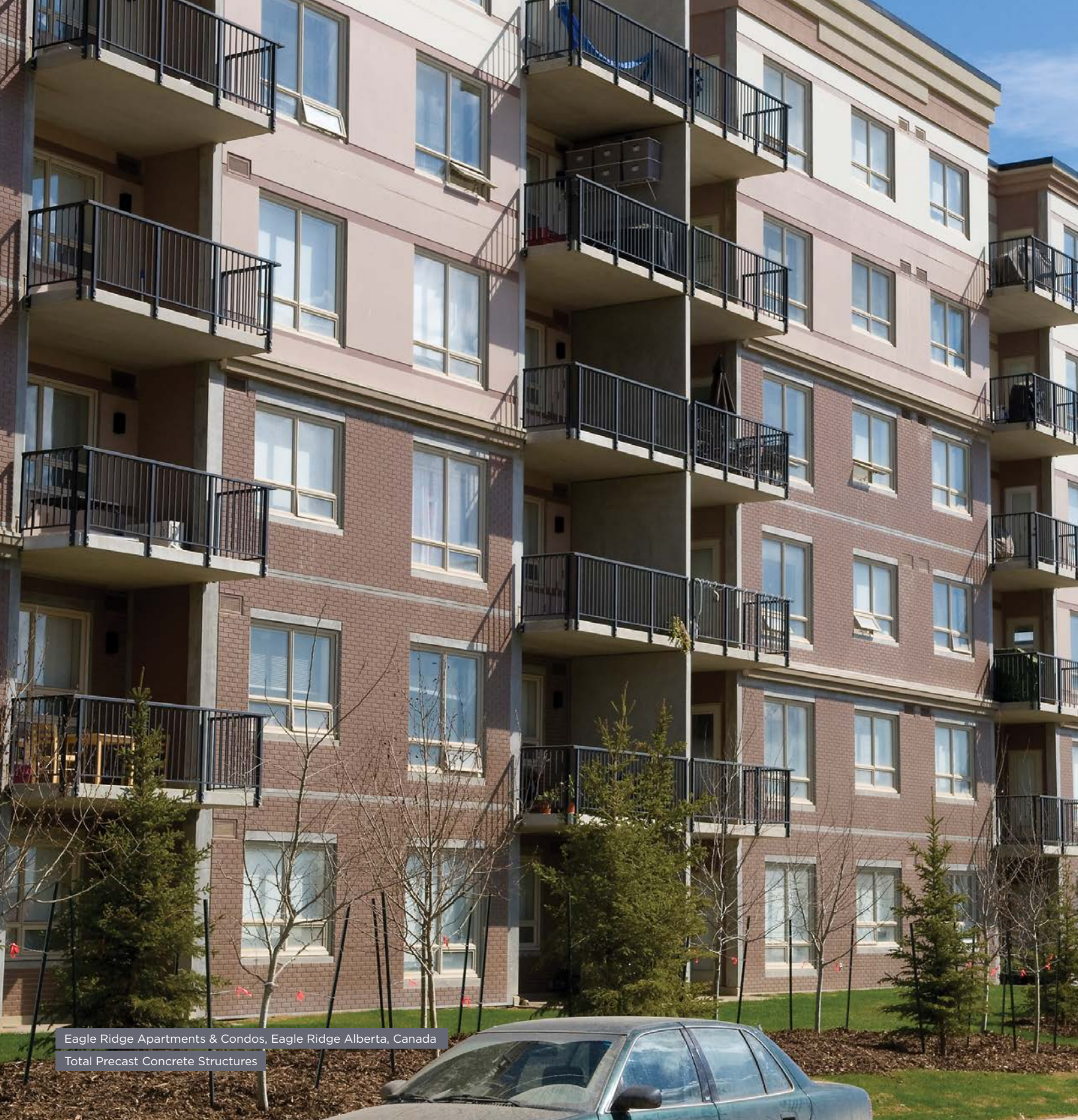
Eagle Ridge Apartments & Condos, Eagle Ridge Alberta, Canada