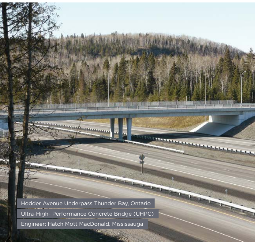
Hodder Avenue Underpass Thunder Bay, Ontario

Ultra-High- Performance Concrete Bridge (UHPC)