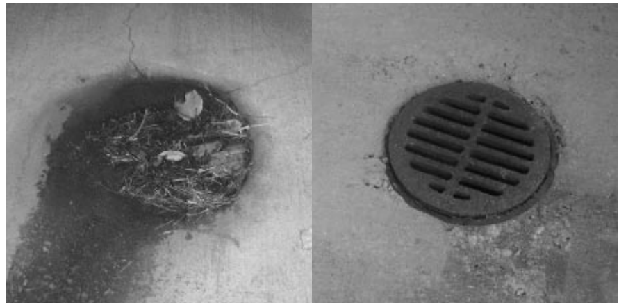
Drains not properly cleaned will cease to function and produce ponding, deterioration and costly repairs.

Studies have shown that fine cracks (0.007 in. or less) are typically regarded as non-detrimental to the serviceability of the deck and have little influence on the corrosion process. This is due to the dense matrix of the concrete and the shal-